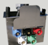
POWER OUTLET BOX